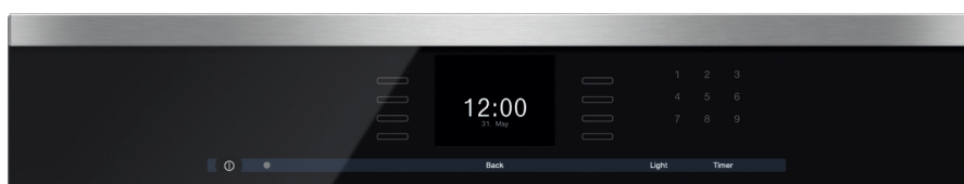
SensorTronic controls clearly present menu content