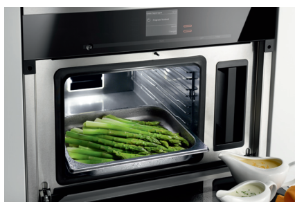
Bigger cavity — 26% more capacity with MultiSteam technology