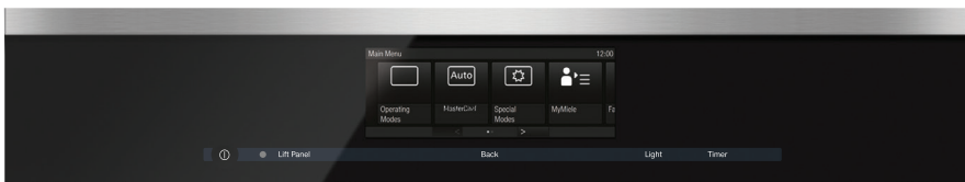
M Touch controls for easy navigation with the swipe of the screen