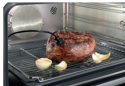
Wired roast probe for the perfect roasting results