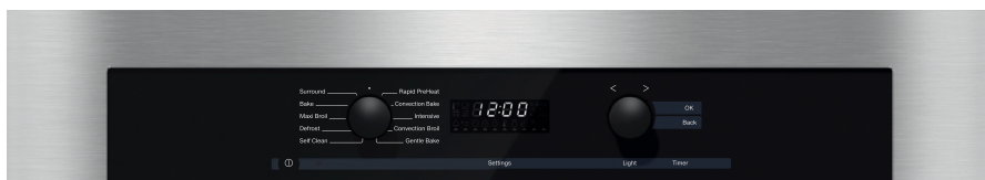
DirectSelect controls with 7-segment LCD display