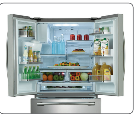
French Door design provides easy access to fresh food and flexible storage options.