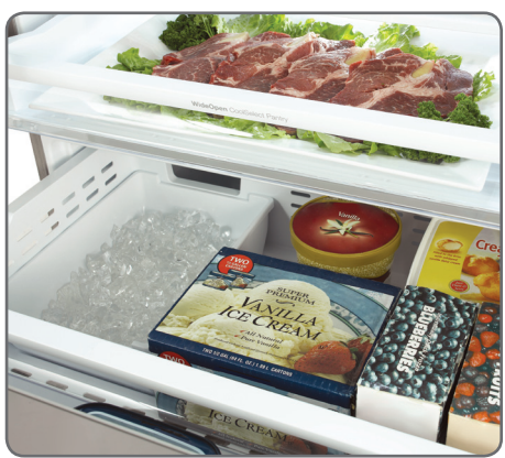
Filtered Dual Ice in Freezer.