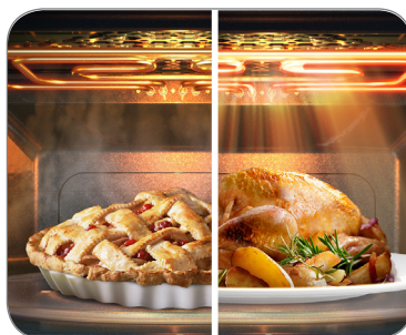
Power Convection/PowerGrill Duo™