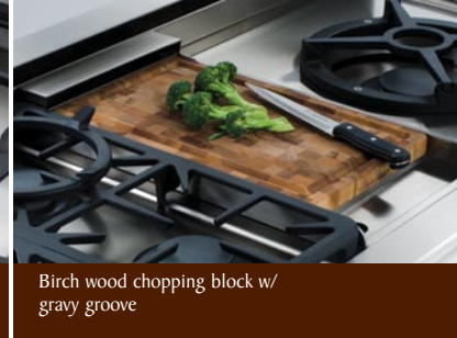
Birch wood chopping block w/ gravy groove