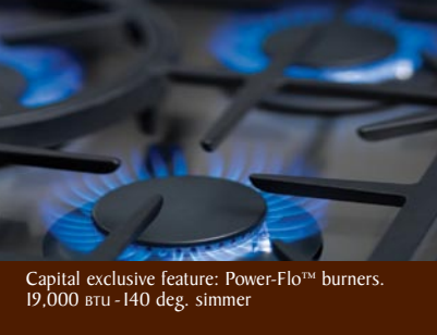
Capital exclusive feature: Power-Flo™ burners. 19,000 BTU - 140 deg. simmer