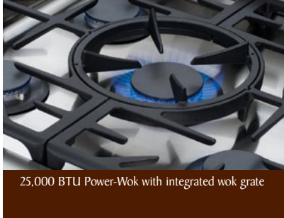
25,000 BTU Power-Wok with integrated wok grate