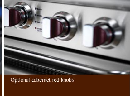
Optional cabinet red knobs