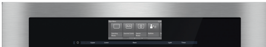
M Touch controls for easy navigation with the swipe of the screen