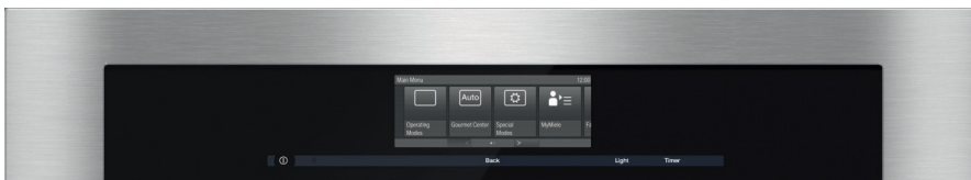
M Touch controls for easy navigation with the swipe of the screen