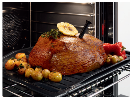
Wireless Roast Probe