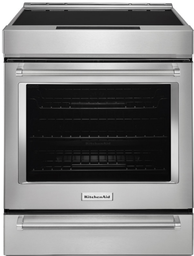
Stainless Steel KSIB900ESS