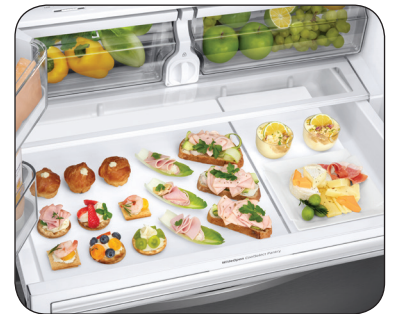
CoolSelect Pantry™ with Temperature Control