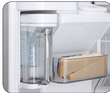
AutoFill Water Pitcher