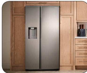
Built-in Look with Counter Depth

Fingerprint Resistant Black Stainless Steel