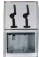
Prep for Coin ("X")