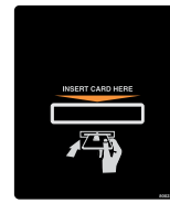
Prep for Card ("Y")