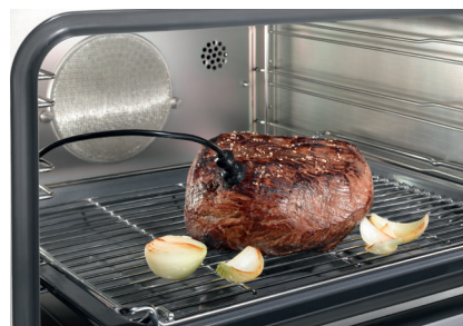
Wired roast probe for perfect roasting results