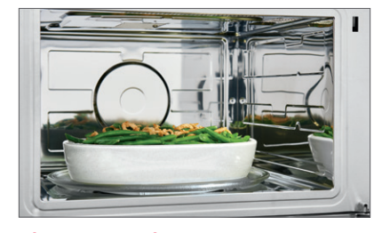
Fits-More™ Microwave Extra-large microwave provides 1.6 cu. ft. of cooking space.