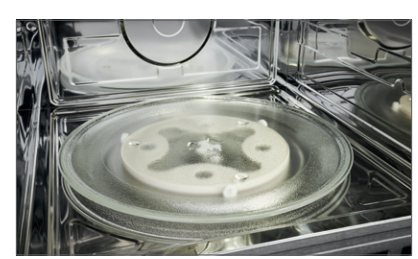
Extra-Large 14-3/16" Diameter Glass Turntable

Big bowls and large casserole dishes are no problem for our extra-large glass turntable. It rotates for even cooking.