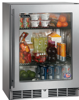
Glass Door Model