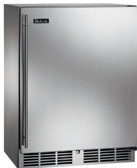
Solid Door Model