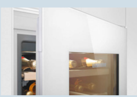
UV Protection: In order to minimize the exposure of light which can damage the maturity of a wine, Liebherr wine cabinets are fitted with special UV-resistant insulated glass, simultaneously protecting and presenting your finest wines.