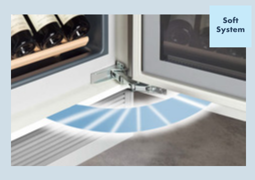
SoftSystem: Liebherr's SoftSystem technology gently cushions the automatic door closing, preventing vibrations which can affect the quality of your finest wines.

German Engineering: Our superior products offer premium quality, cutting edge design, and innovative features that best fit your lifestyle. The use of high quality materials, perfectly detailed finishes, and elite cooling components are combined with the latest production processes, resulting in an outstanding cooling product.