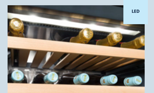
LED Ceiling Light: The energy efficient LED ceiling light not only emits virtually no heat for the optimal storage of wines, but is dimmable for a pleasant ambient light within the cabinet, as well as a cool glow for the room.