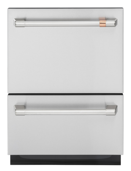
CDD420P2TS1 Stainless Steel with Brushed Stainless handle

CDD420P3TD1 Matte Black with Brushed Stainless handle