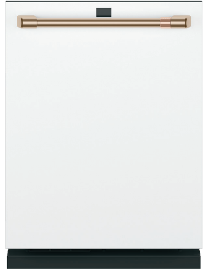
CDT875P4NW2 Matte White with Brushed