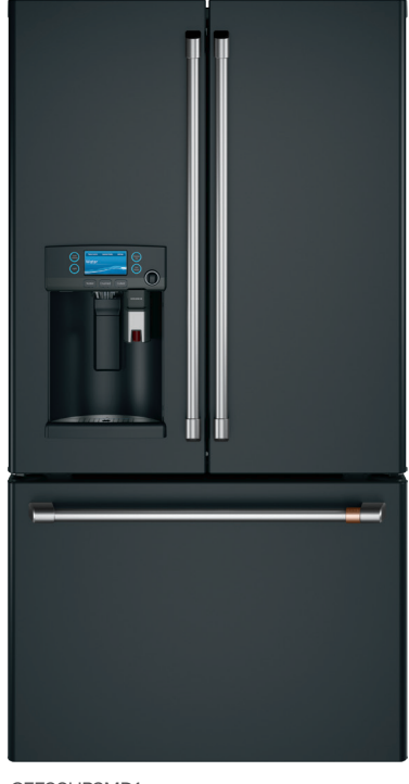
ALSO AVAILABLE IN