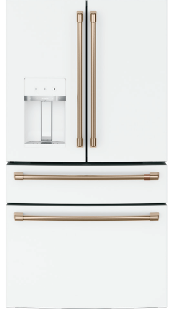
CVF28DP4NW2 Matte White with Brushed Bronze handles