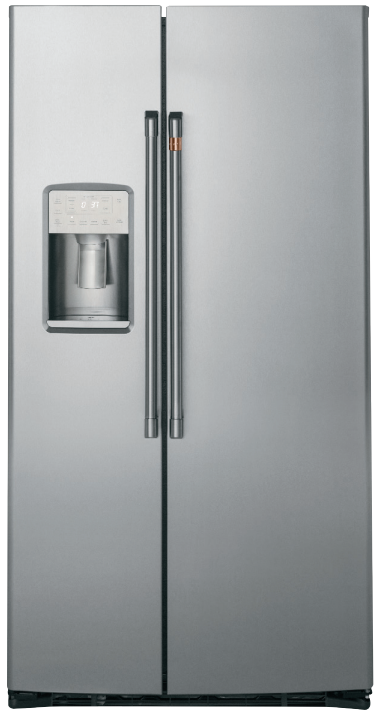
CZS22MP2NS1 Stainless steel with Brushed Stainless handles