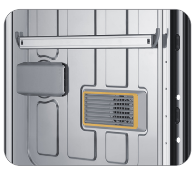
Smart Dry with AutoRelease™ Door