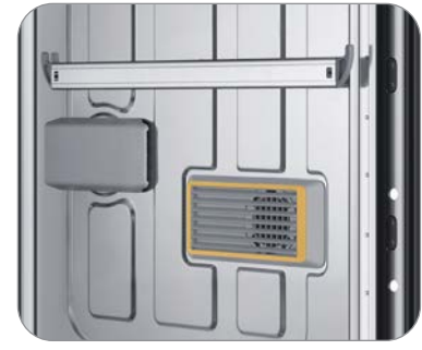
Smart Dry with AutoRelease™ Door

Fingerprint Resistant Navy Steel (panel sold separately)