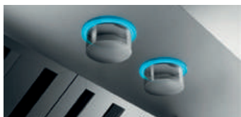
IN/OUT Backlit Knob

Give a splash of Italian design to your professional kitchen with Vavano's crisp lines, seamless welded corner craftsmanship, beveled rim and gleaming stainless steel. No ear plugs required with Vavano's HUSH sound suppression system, which enables you to comfortably talk and entertain, even when cooking up a storm.