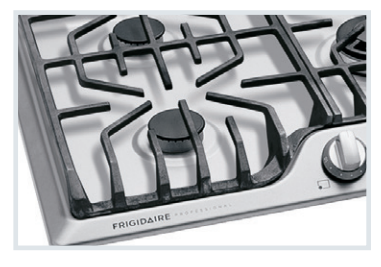
Stainless Steel Cooktop The entire cooktop surface is stainless steel to blend with the other appliances in your kitchen.