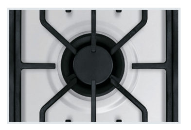
PowerPlus® Burner Boil, sear, and sauté with power. The PowerPlus® Burner delivers strong performance, every time with 18,200 BTU.