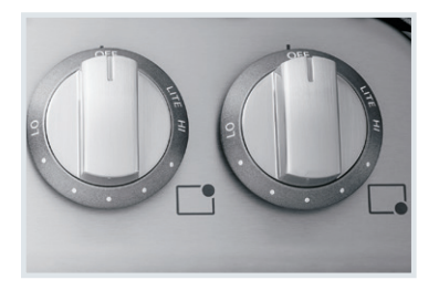
PrecisionPro Controls<sup>™</sup> Prepare a range of dishes with precision, whether you're simmering, sautéing, searing or boiling.