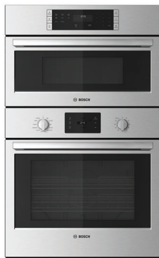
HBL5754UC Stainless Steel

The Bosch Combination Wall Oven combines your favorite tools into one appliance. The lower oven is a convection oven, roaster, warming drawer and more.