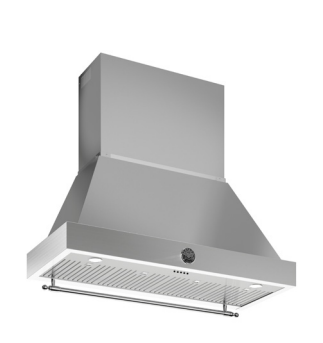
K48HERTX + KC48HERTX Stainless steel canopy