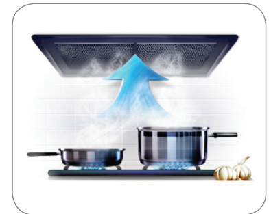
300 CFM Ventilation System