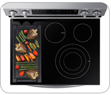
Removable Non-Stick Griddle