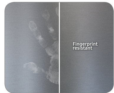
Fingerprint Resistant Finish