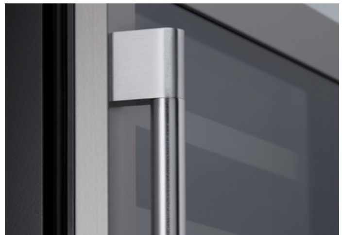
Optional Pro Handle