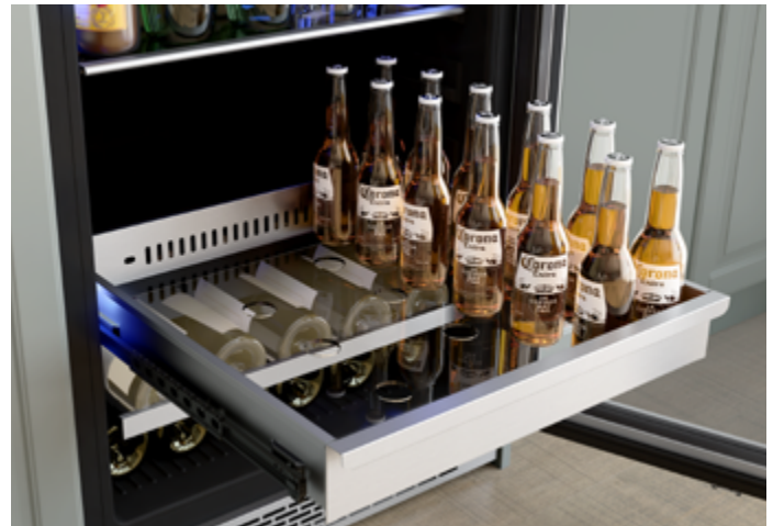
Full-Extension Stainless Steel Rollout Bin with Transparent-Gray Glass