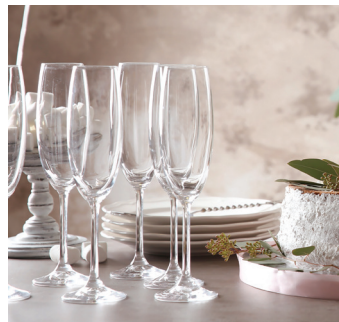
Manually raise or lower the upper rack for large casserole dishes or tall stemware.