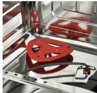
Place your most soiled pots and pans near the third sprayer for extra scrubbing power with Power Wash.