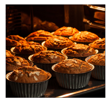
Keep an eye on your food from the outside with bright, halogen lighting