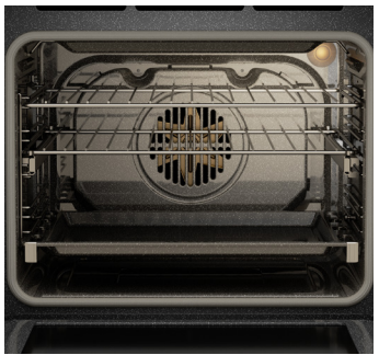
The dedicated heating element and fan of our True European Convection cooks more evenly than conventional ovens

The included glide-rack allows forremoving even the heaviest dishes