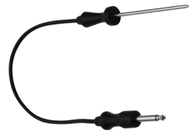
Meat Temperature Probe