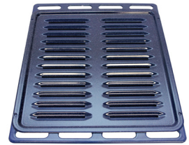
Broiler Pan / Grid

Internal capacity calculated by measuring maximum width, depth and height. Actual capacity for holding food is less.