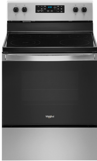
Stainless Steel WFE505W0JS