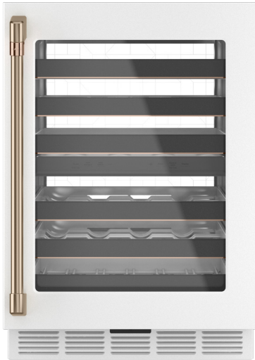
CCP06DP4PW2 Matte White with Brushed Bronze handles