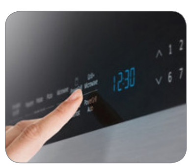
Precise Glass Touch Controls