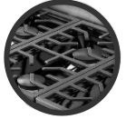
Continuous Grates maximize cooking surface