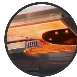
High Power Infrared Broiler