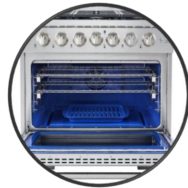
Large Capacity Oven with Blue Interior