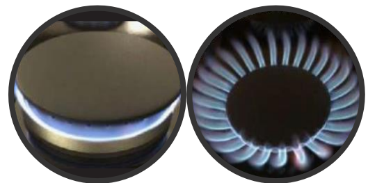
Ultra Low Simmer and High Power Dual Burners