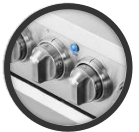
Premium LED lit metal knobs