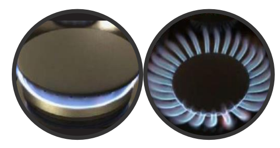
Ultra Low Simmer and High Power Dual Burners