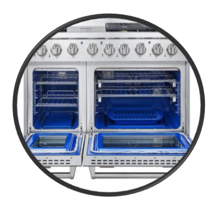
Large Capacity Oven with Blue Interior