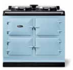
DUCK EGG BLUE