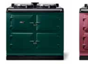
BRITISH RACING GREEN