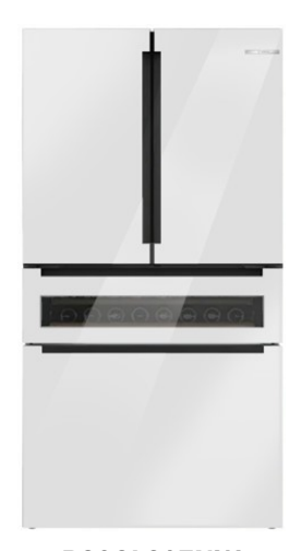
B36CL81ENW Glass over White w/ Recessed Handles

The industry's first Refreshment Center featuring the new glass front display drawer. Presenting a dedicated drawer with five preprogrammed settings, providing the optimal storage environment for all of your beverage needs.