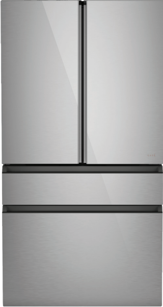
CGE29DM5TS5 Platinum Glass with Integrated Pockets