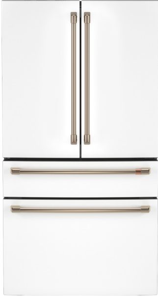
GE29DP4TW2 Matte White with Brushed Bronze handles