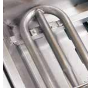
STAINLESS STEEL BURNERS