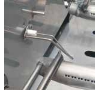
SPARK IGNITION SYSTEM