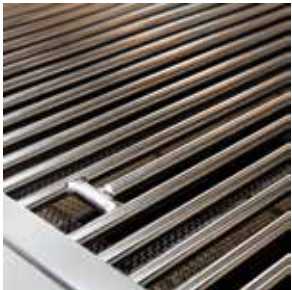
EXPANSIVE GRILLING SURFACE

FOR MORE INFORMATION ON SEDONA BY LYNX™ SERIES PRODUCT FEATURES, PLEASE VISIT LYNXGRILLS.COM