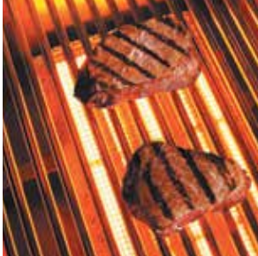
PROSEAR™ INFRARED BURNER

The Sedona by Lynx™ Series is always evolving to be the best at something new. That philosophy is reflected in its features. We've refined these features to give you a grilling experience that's both simple and stunning.