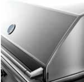
SEAMLESS WELDED CONSTRUCTION