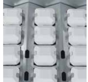
CERAMIC RADIANT BRIQUETTES