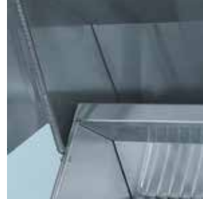
LYNX HOOD ASSIST