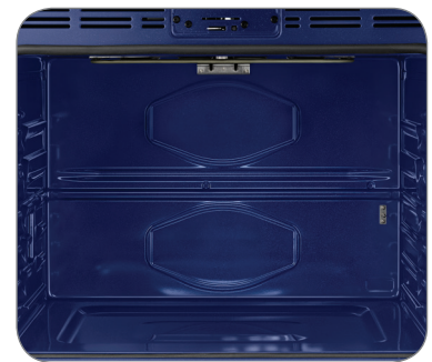
Blue Ceramic Interior