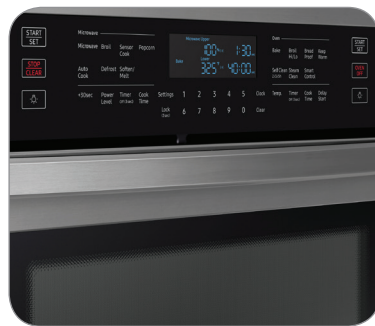
Digital Touch Controls

Fingerprint Resistant Black Stainless Steel