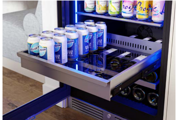
Full-Extension Stainless Steel Rollout Bin with Transparent-Gray Glass