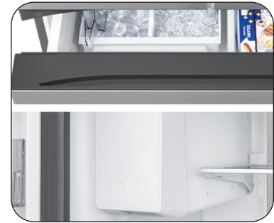
Refrigerator: Curved and Crushed Ice Freezer: Cubed and Ice Bites™