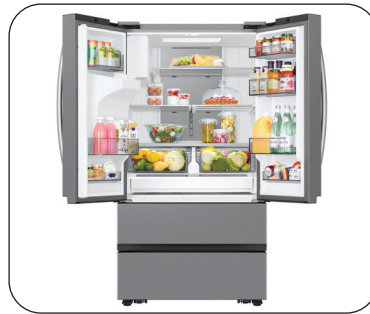
Large 25 cu. ft. Capacity