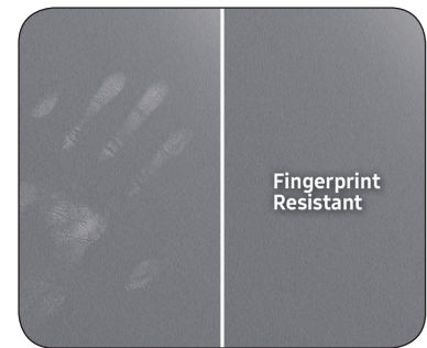
Fingerprint Resistant Finish